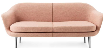
Sum Sofa Camira Synergy