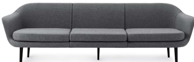
Sum Sofa Camira Synergy