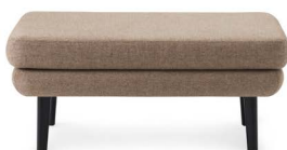
Sum Pouf Camira Main Line Flax

Material: Soft molded PU foam, steel. Legs: Aluminum