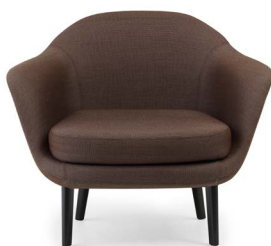
Sum Armchair Camira Main Line Flax