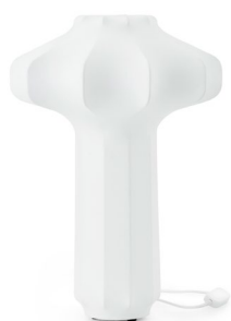
Phantom Table Lamp H: 43 x Ø: 29,5 cm