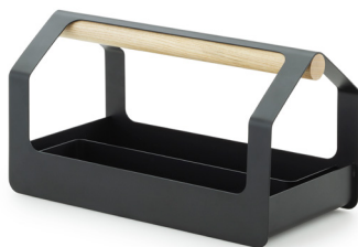
Haus Toolbox Black