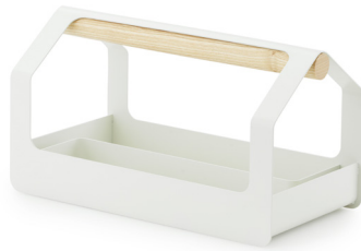
Haus Toolbox Light Grey