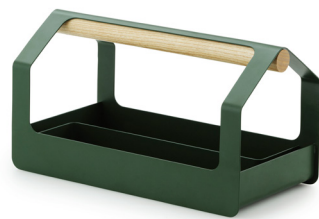
Haus Toolbox Dark Green