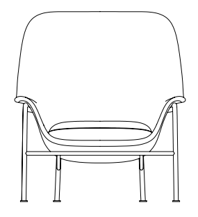
Drape Lounge Chair high steel legs H: 111,5 x L: 77,5 x D: 83 x SH: 43 cm