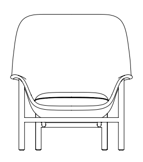
Drape Lounge Chair high wood legs H: 103 x W: 93 x D: 84 x SH: 43 cm