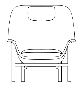
Drape Lounge Chair high w. headrest wood legs H: 116,5 x L: 82,5 x D: 82,5 x SH: 43 cm