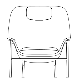
Drape Lounge Chair high w. headrest steel legs H: 111,5 x L: 77,5 x D: 83 x SH: 43 cm

Upholstery: All colors in Camira: Synergy, Main Line Flax, Aquarius, Oceanic, Yoredale. Sørensen Leather: Ultra Leather. Kvadrat: Remix 3, Canvas, Steelcut Trio, Hallingdal, Divina, Divina MD, Divina Melange, Fiord, Vidar, Elle & Zero. Upholstery limitations: Piping and seat cover options in Ultra Leather are limited to the following four: Black 41599, Brandy 41574, Cognac 41598, Camel 41571 Materials: Shell: Hard molded PU foam w. steel reinforcement. Cushion: Soft modled PU foam. Legs: Steel: Powder coated steel. Wooden legs: Lacquered or painted and lacquered oak. Price: Click here to see the pricelist in all currencies